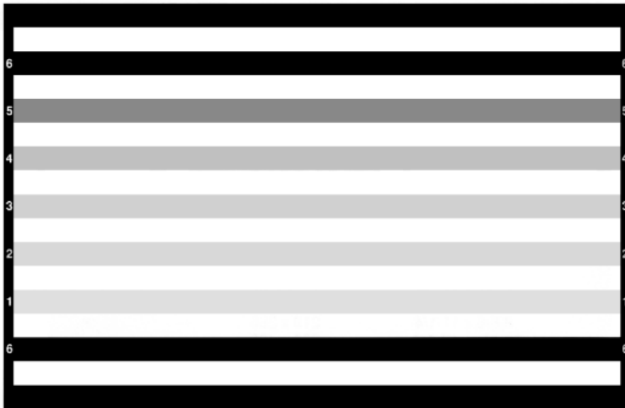
Form CU-1M Test Area 6 ft 2 (5574 cm 2 ) 24 x 37-1/4 in (610 x 946 mm) Conforms with ASTM D5150, Hiding Power of Architectural Paints Applied by Roller

These are sealed paint test charts with six stripes on a white field, ranging in shade from very light gray to black. The stripes are numbered 1 to 6, representing uniform steps of increasing contrast. The hiding power of the applied coatings is rated as the number of the darkest stripe that is completely (or almost completely) obscured, at a specified thickness or spreading rate. Form CU-1M is used for more practical large-area brush or roller applications as in ASTM D 5150. Applications on Form 24B are with a drawdown blade. See Appendix, Page 33 for gray scale values.