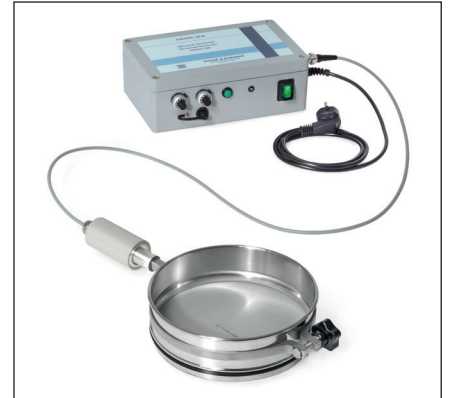
By the use of HAVER UFA the sieving of loose adhesive materials is made possible