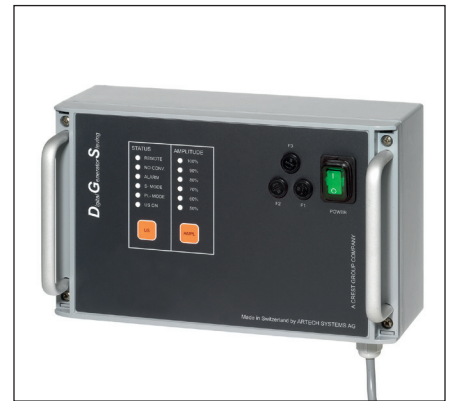
Digital generator for the simultaneous vibration of up to three test sieves (DGS35-50-T)