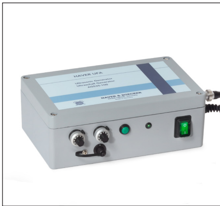
Analogue generator for the vibration of a test sieve (AGS35-100)