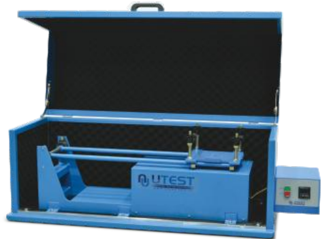
UTCM-0091 Jolting Table with Soundproof Safety Cabinet

UTCM-0093 Feed Hopper is used for filling UTCM-0092 Three Gang Moulds placed on the Jolting Table.