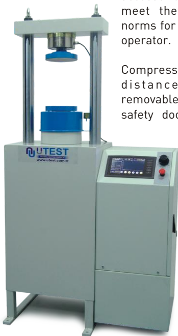
UTCM - 6331

Compression and flexure jigs, distance pieces, and also removable transparent front-rear safety doors (should be factory installed) should be ordered separately.