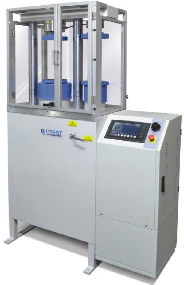
UTCM-6431 with Transparent Front-Rear Safety Doors

The UTEST automatic cement compression and flexure testing machines allow less experienced operators to perform the tests. Once the machine has been switched on and the specimen is positioned and centered by the help of centering apparatus. The only required operations are;